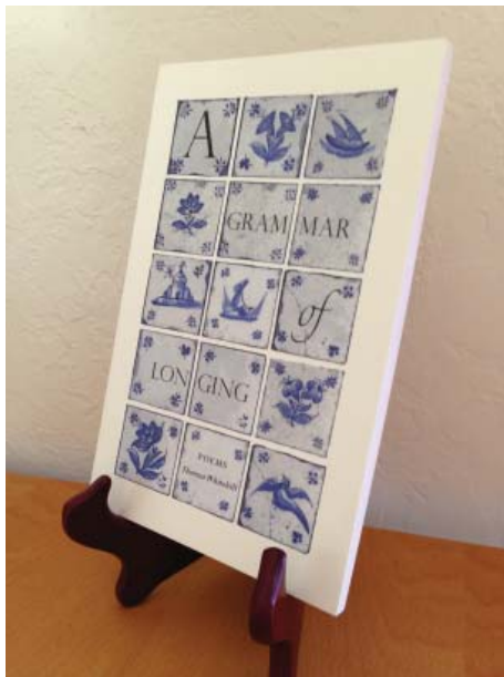
GRAMMAR OF LONGING OFFSET BOOK WITHOUT DUST JACKET