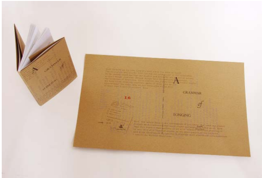
DUST JACKET & COMPANION BROADSIDE